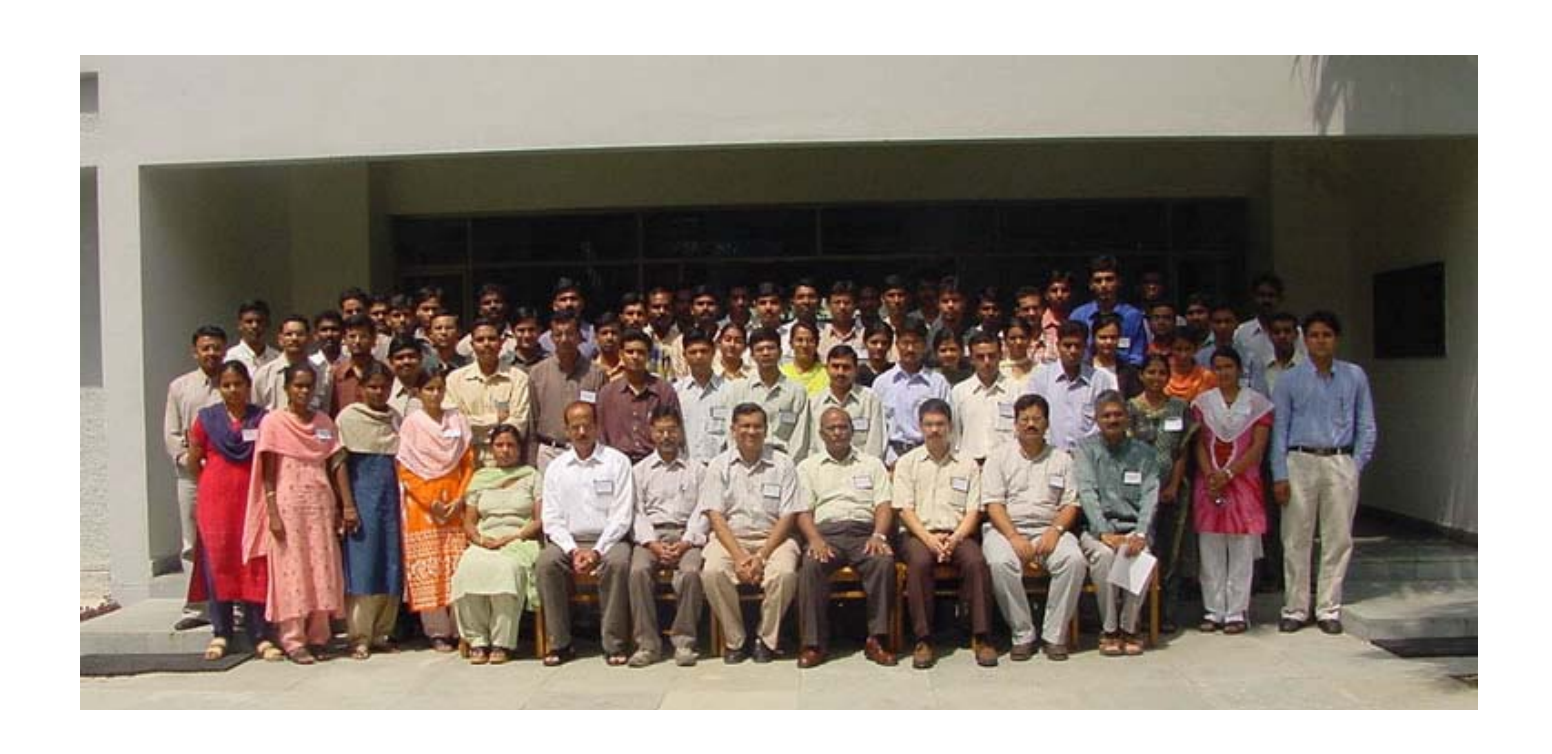
Group Photograph of the participants at the inauguration