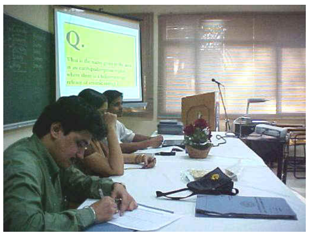
Earthquake Engineering Quiz