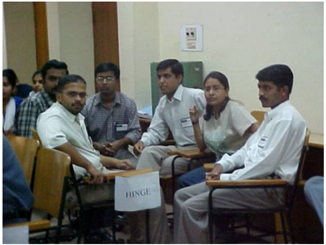
Students' Group participating in Earthquake Engineering Quiz