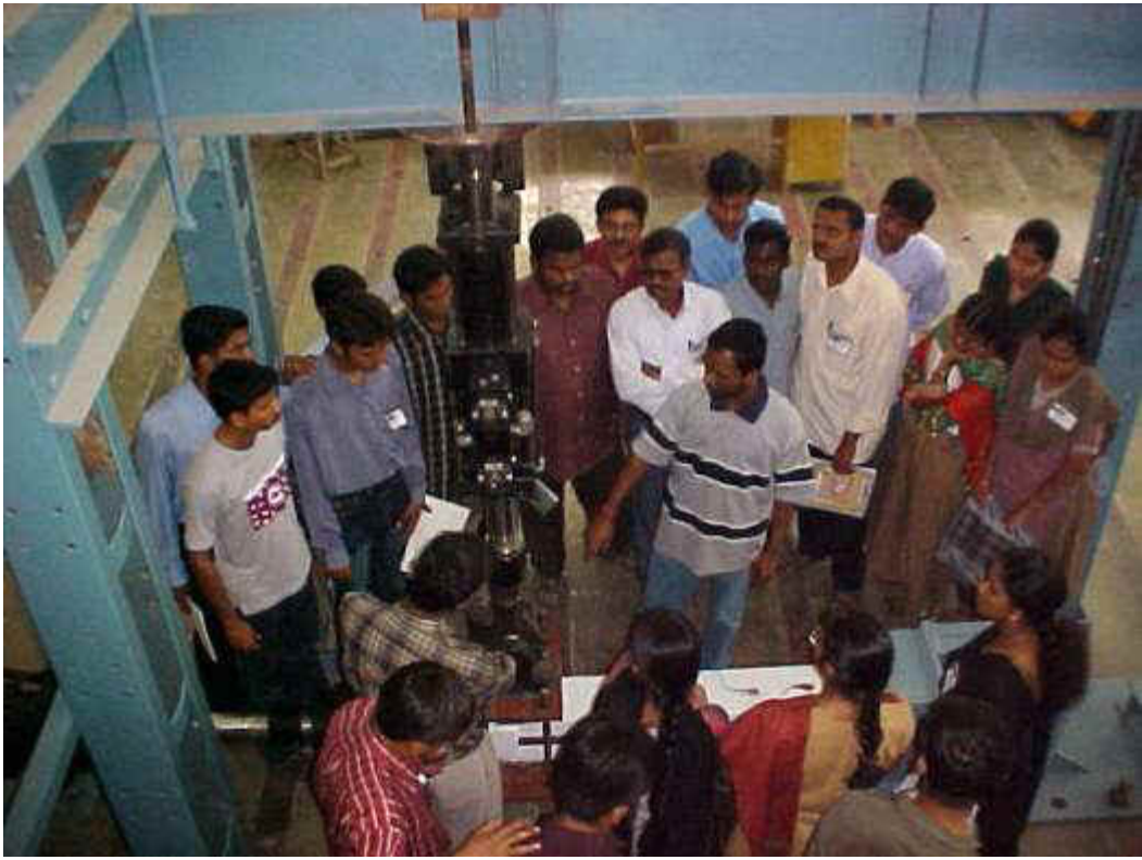
Visit to Structural Engineering Laboratory (Pseudo-Dynamic Testing Facility)