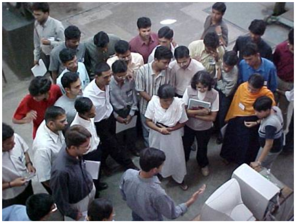
Visit to Structural Engineering Laboratory (Material Testing Facility)