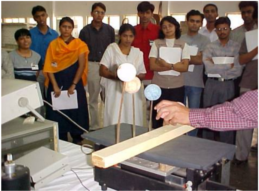
Visit to Structural Engineering Laboratory (Dynamic Experiment Demonstration)